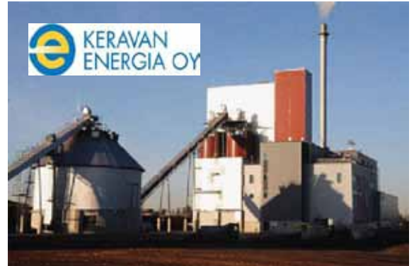
Keravan bio heat plant

Keravan Energia Oy is a full service energy group whose business idea is to improve the economy and competitiveness of the clients in its distribution area by means of economic energy supply. To ensure competitiveness, Keravan Energia is continuously developing and automating its production and distribution.